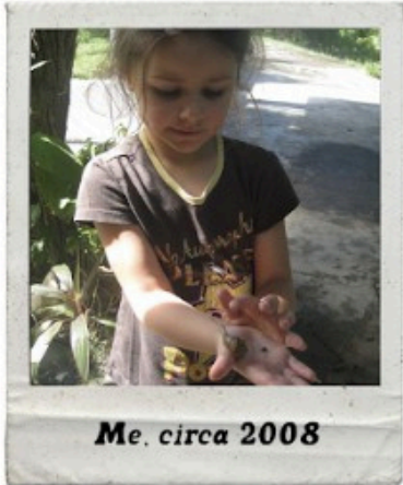
Me. circa 2008